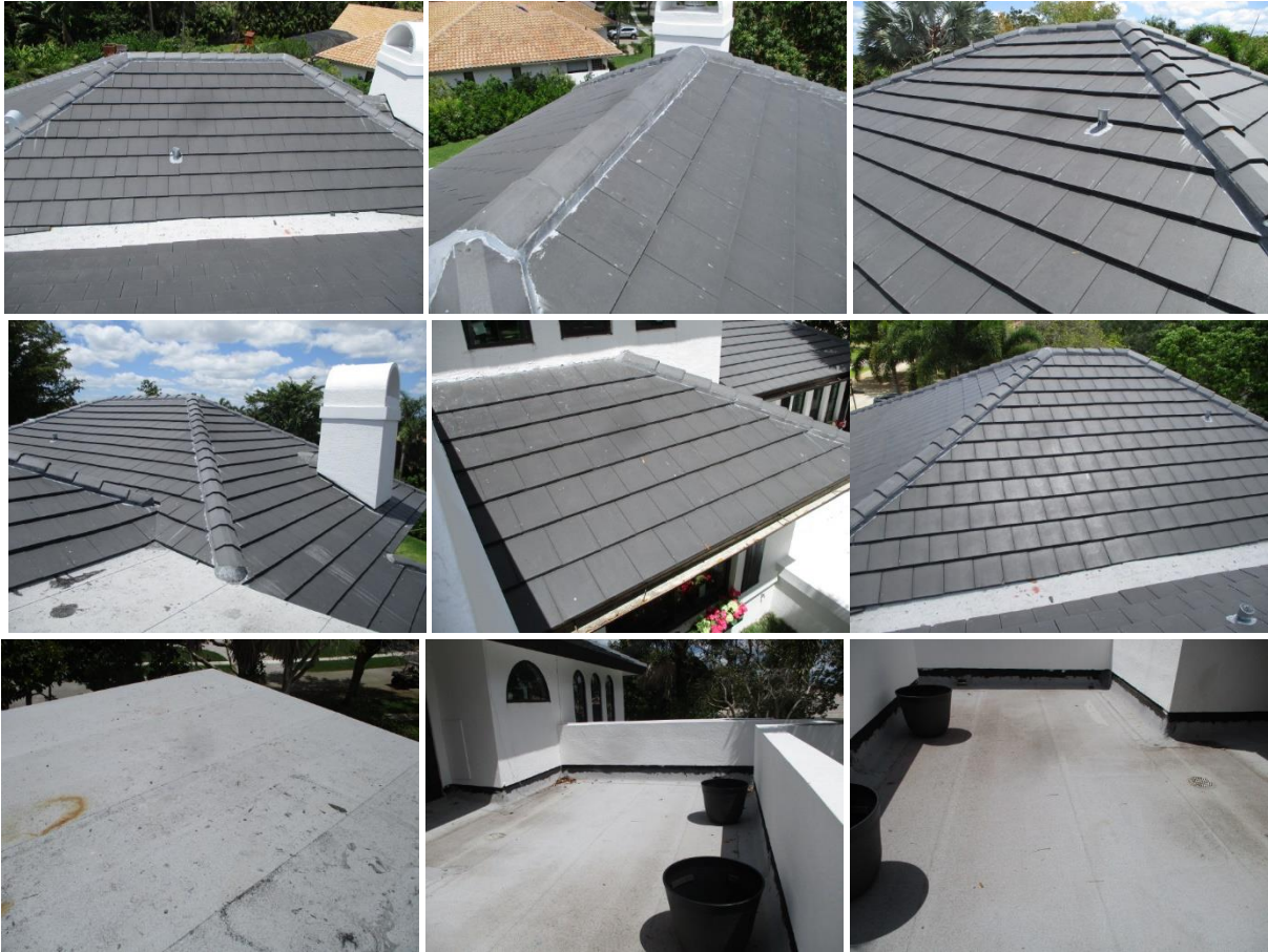
Roof style: Hip & and Flat